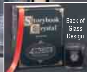
Back of Glass Design