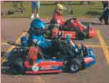
AMSOIL makes this Go-Kart goooo.