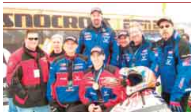
Team AMSOIL is a media favorite.

sponsor of the Big East Snocross Tour and the Rock Maple Racing Association. Dealers in the regions report terrific exposure and increased sales. In fact, sales of AMSOIL 2-Cycle Oil have steadily increased during the period in which AMSOIL has been in snocross racing. The growth isn't accidental. Snowmobile racing has played a tremendous role in the conquering of the snowmobile market in the U.S.